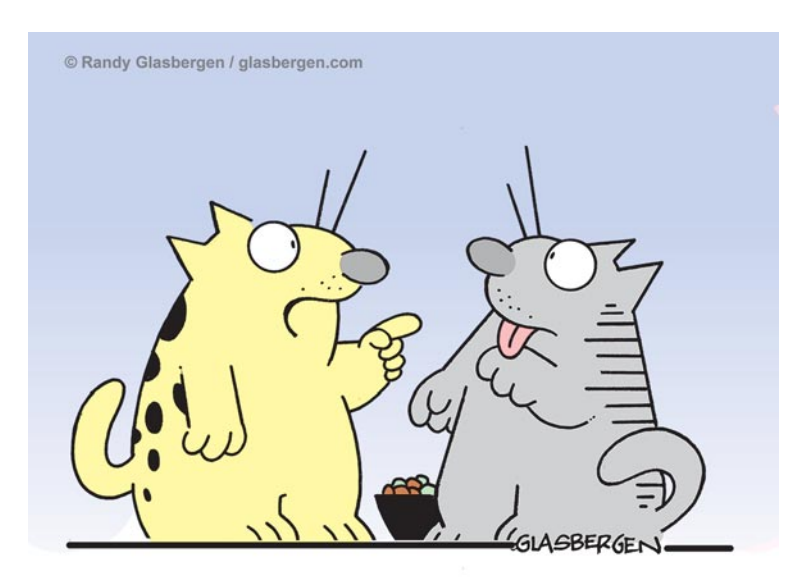
"Licking your paws is only the first step. After that, you need to use a good antibacterial body wash, then an exfoliating herbal facial scrub, followed by an avocado moisturizing cleanser."

The prognosis after surgery depends on the degree of luxation and whether additional injury or arthritis has occurred in the knee. Appropriate rest/recuperation followed by physical therapy are key to successful outcomes after surgery. Overweight cats and dogs will have a much harder time dealing with low grade luxating patellas and are less successful in recovering from surgery.